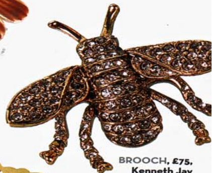
BROOCH, £75, Kenneth Jay Lane, from my-wardrobe.com