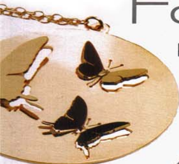
22-CARAT GOLD-PLATED NECKLACE, £90, Eva Gozlan, from manjoh.com