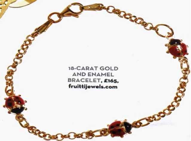
18-CARAT GOLD AND ENAMEL BRACELET, £165, fruittjewels.com