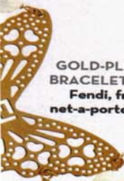
GOLD-PLATED BRACELET, £157, Fendi, from net-a-porter.com