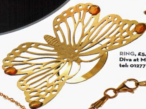
RING, £5, Diva at Miss Selfridge, tel: 01277 844437