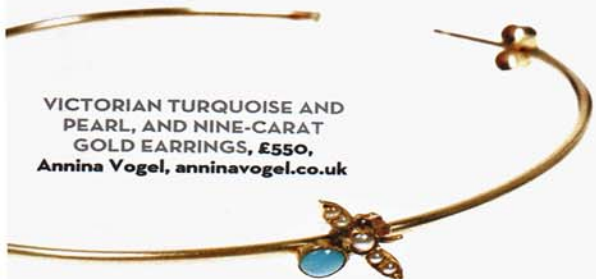
VICTORIAN TURQUOISE AND PEARL, AND NINE-CARAT GOLD EARRINGS, £550, Annina Vogel, anninavogel.co.uk